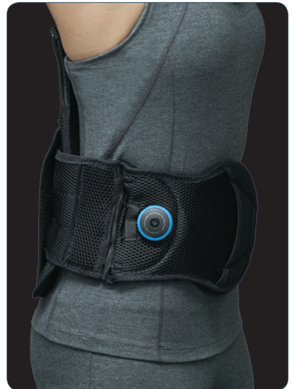
Warrior® Spine 648