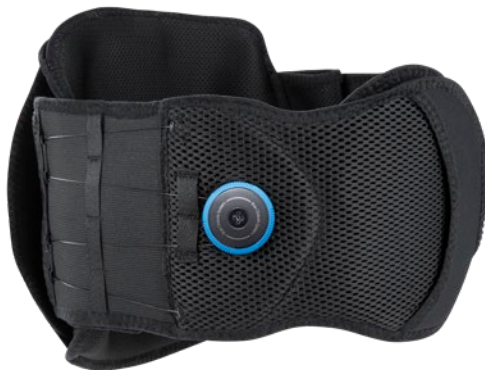
Warrior® Spine 642