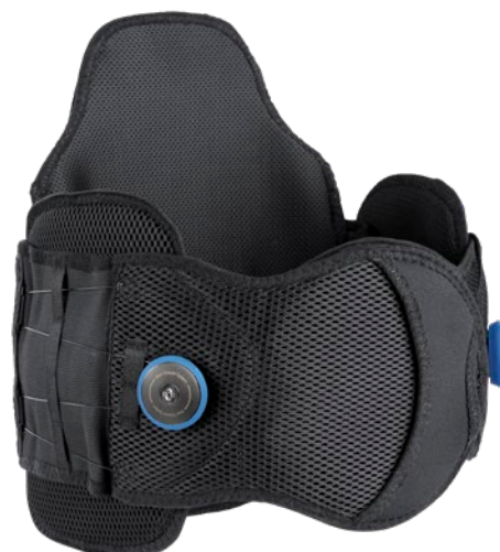
Warrior® Spine 650